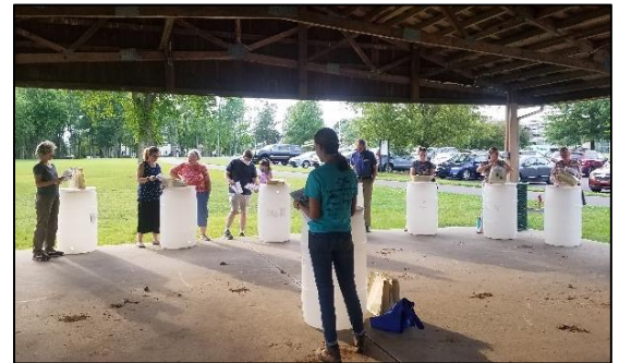
Residents of Upper Gwynedd Township participated in a Rain Barrel Workshop this summer.

Patron Level: $500 – Patrons are eligible for the following membership benefits: