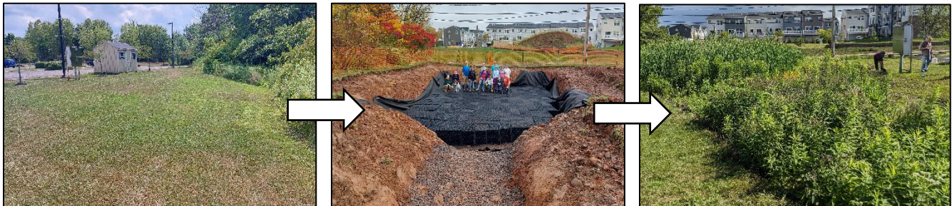
Installation of aqua-blocks followed by native plants in the Stony Creek rain garden project.