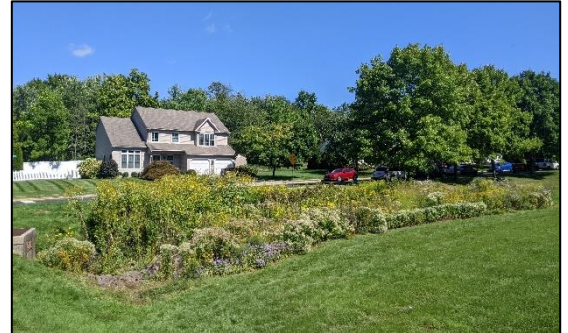
PWC completed this stormwater basin naturalization in the fall of 2018 through the MS4 grant program.